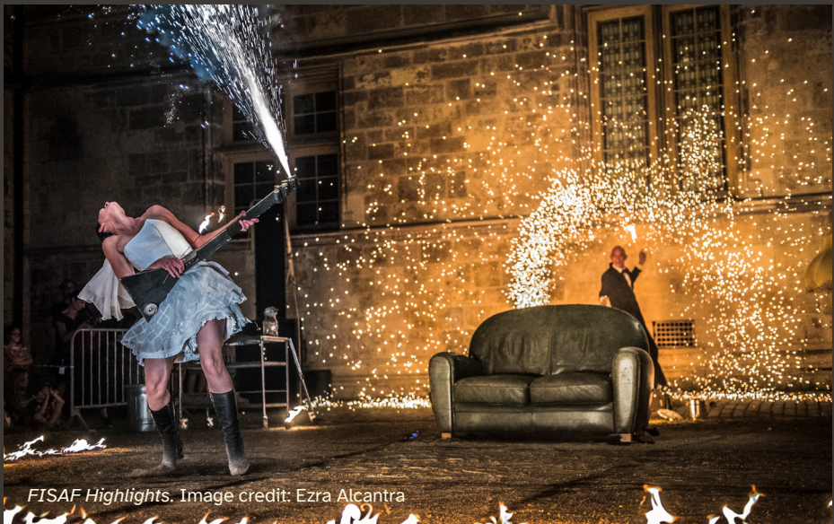
FISAF Highlights.

A joyous showcase of one of the world's oldest and richest cultures.