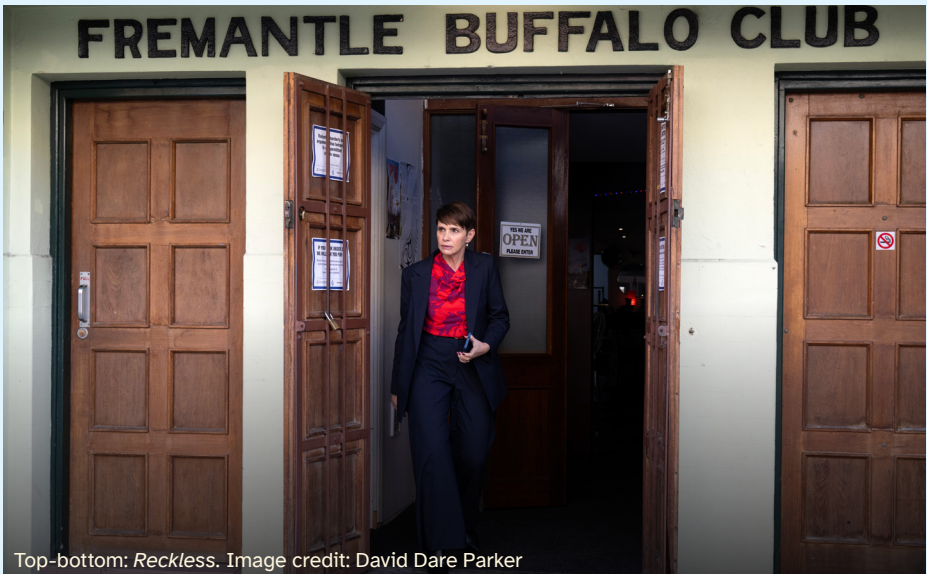
Top-bottom: Reckless.