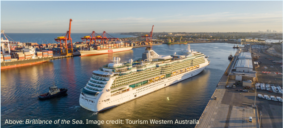
Above: Brilliance of the Sea .