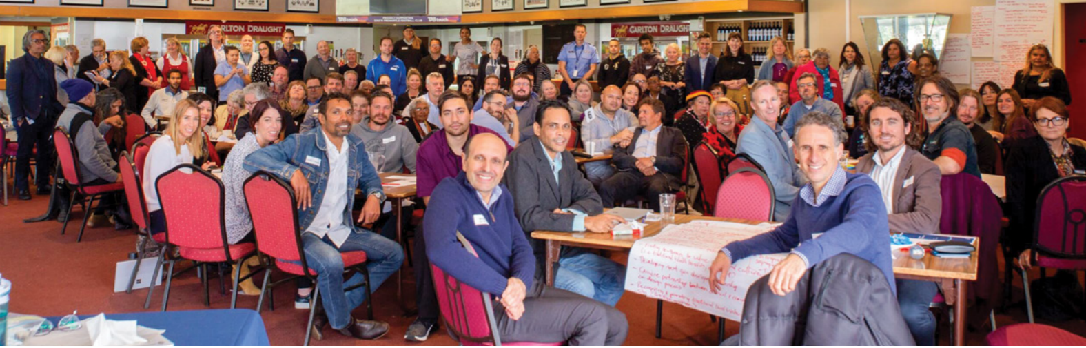
The initial consultation group in 2018 who worked on the City's first Reconciliation Action Plan. Aboriginal and Torres Strait Islander people should be respectfully aware that this picture contains imagery of deceased persons.