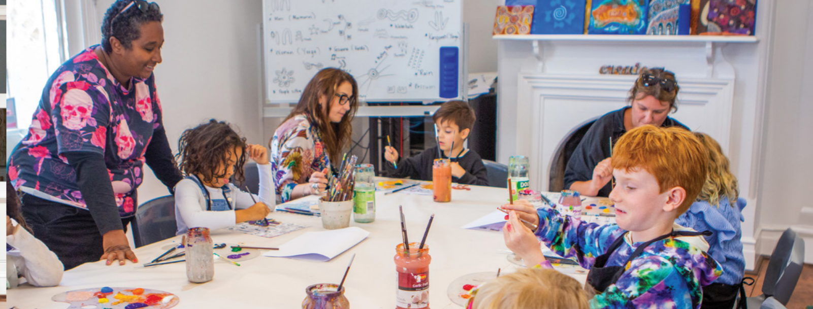
Kids painting classes at Walyalup Aboriginal Cultural Centre.