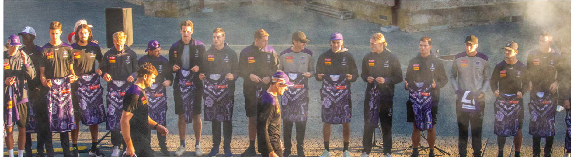
Walyalup Dockers smoking ceremony in 2023.