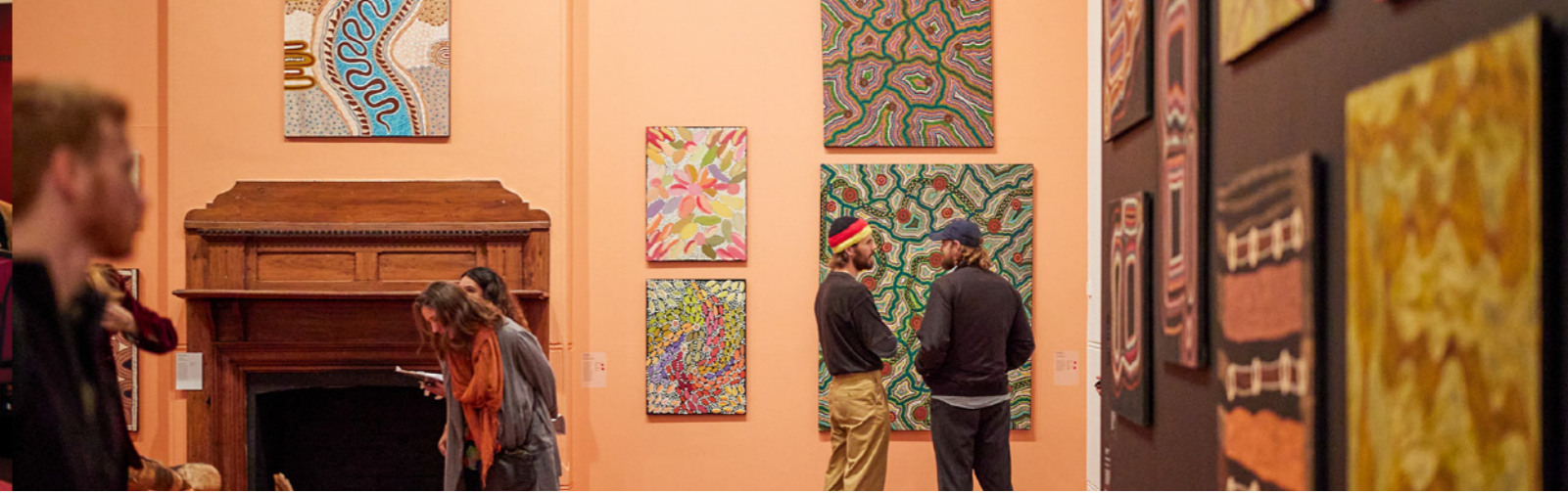
Revealed Exhibition at Fremantle Arts Centre.