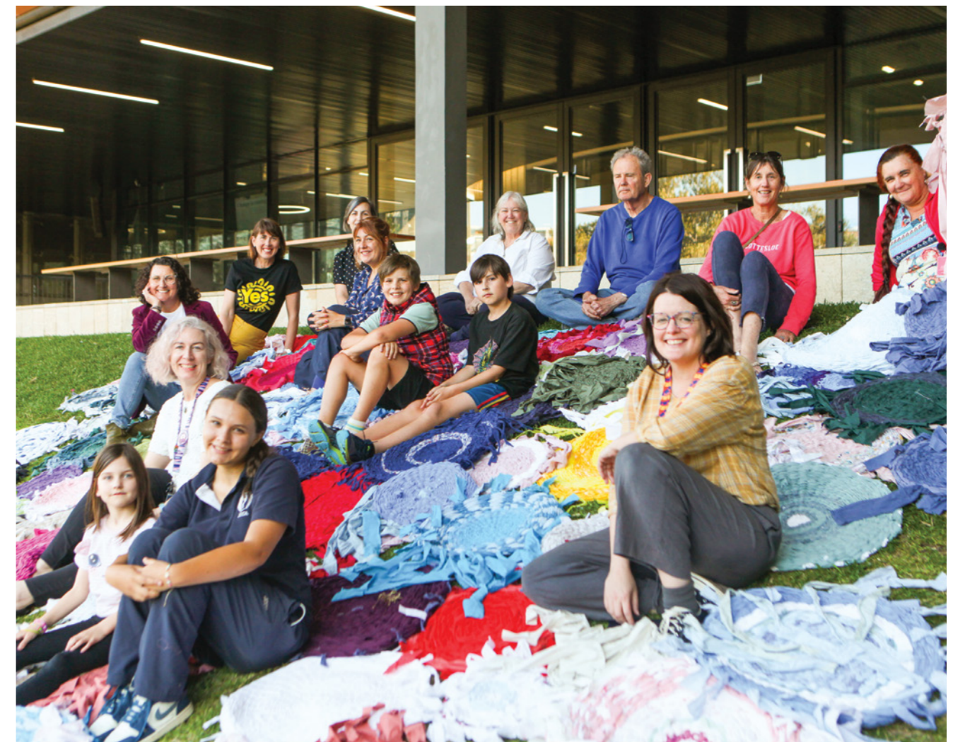
Rug Hub rugs on Walyalup terrace.

Our RAP is a written demonstration of the commitments we make to reconciliation between the City of Fremantle and Aboriginal and Torres Strait Islander people. It provides a framework and timeline for deliverables in a concise document for our City and Aboriginal and Torres Strait Islander people that refer to it as a pathway.