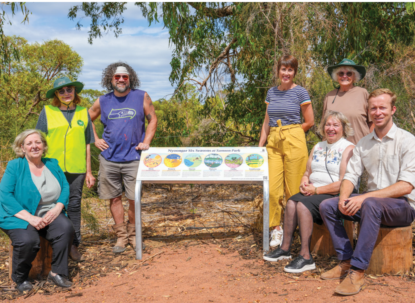
Unveiling the Nyoongar Six Seasons signage at Samson Park.