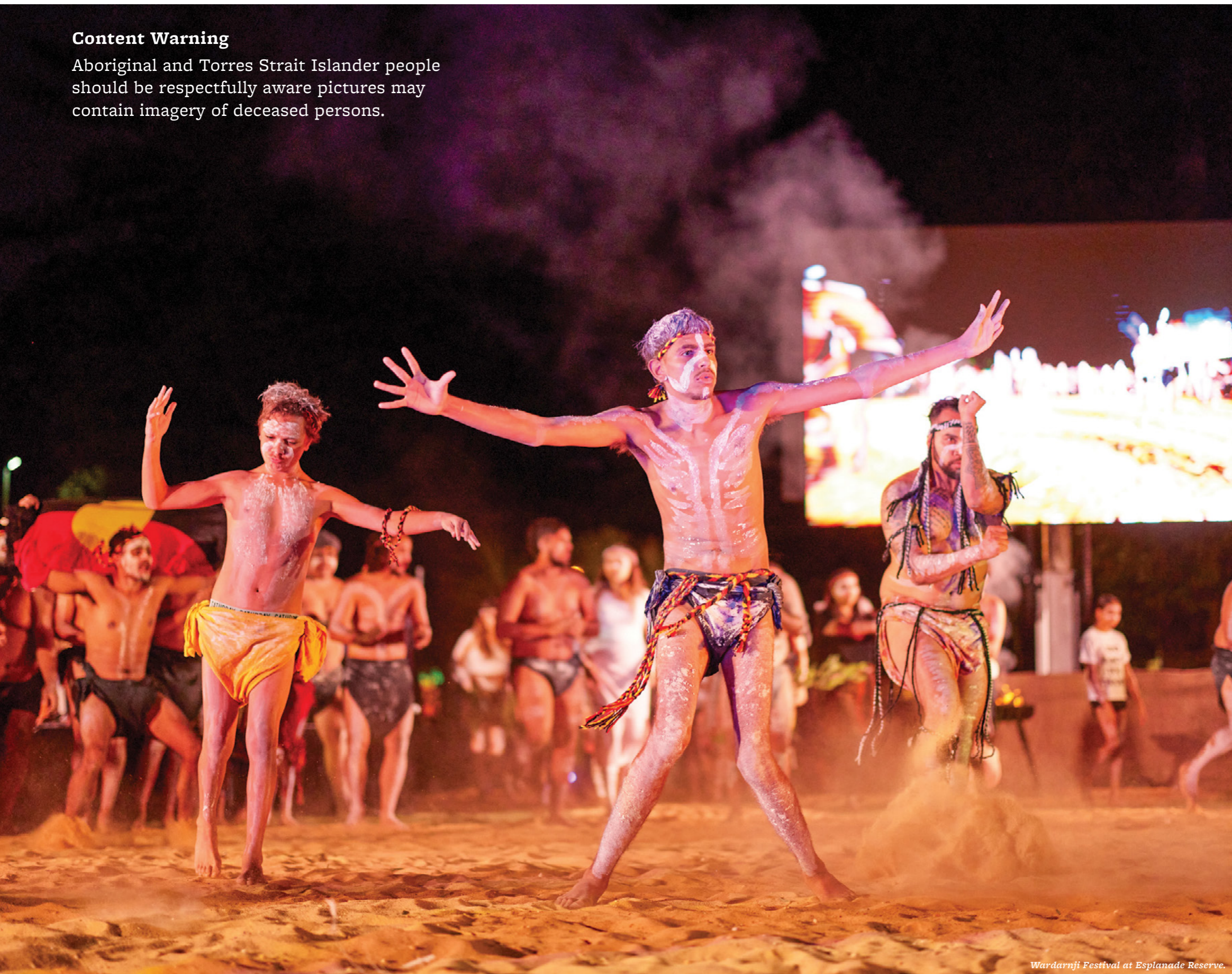
Wardarnji Festival at Esplanade Reserve.

Aboriginal and Torres Strait Islander people should be respectfully aware pictures may contain imagery of deceased persons.