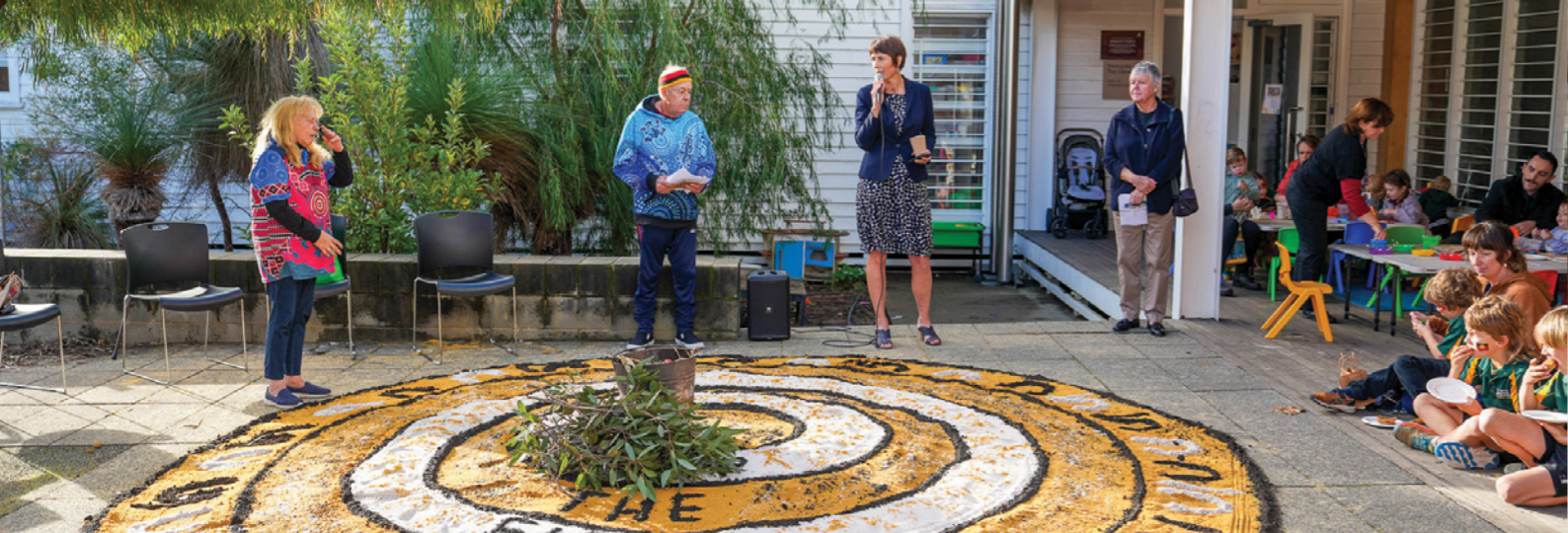
2024 NAIDOC Week celebrations at Hilton PCYC.