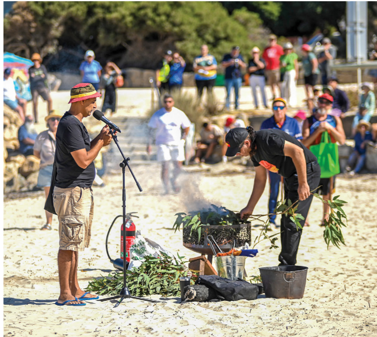
Smoking Ceremony at Manjaree/Bathers Beach.