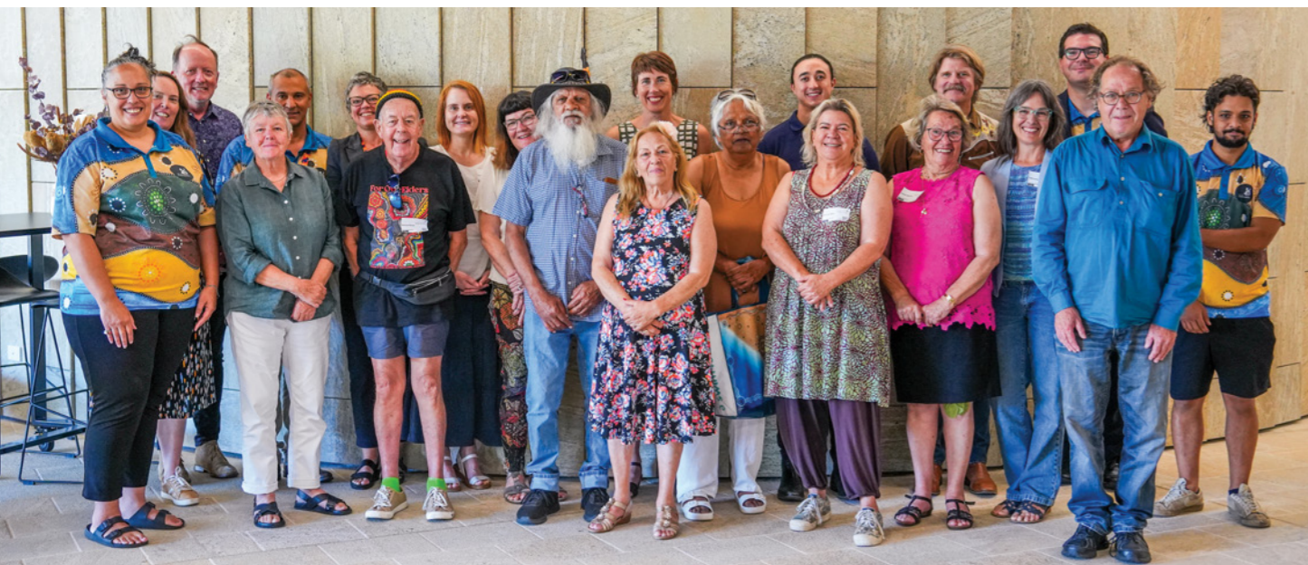
The Walyalup RAP Working Group in 2023.