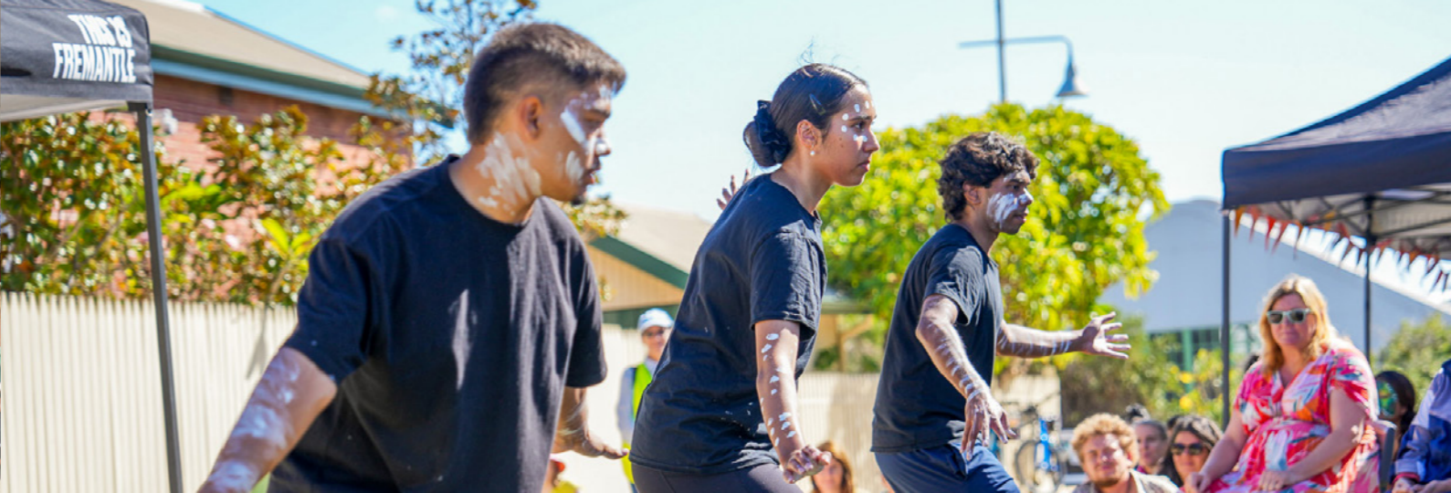
Walyalup Aboriginal Cultural Centre's 10 year anniversary in May 2024.