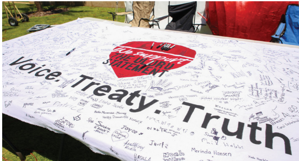
Uluru Statement from the Heart.