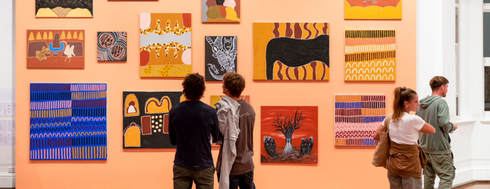
Revealed Exhibition at Fremantle Arts Centre.