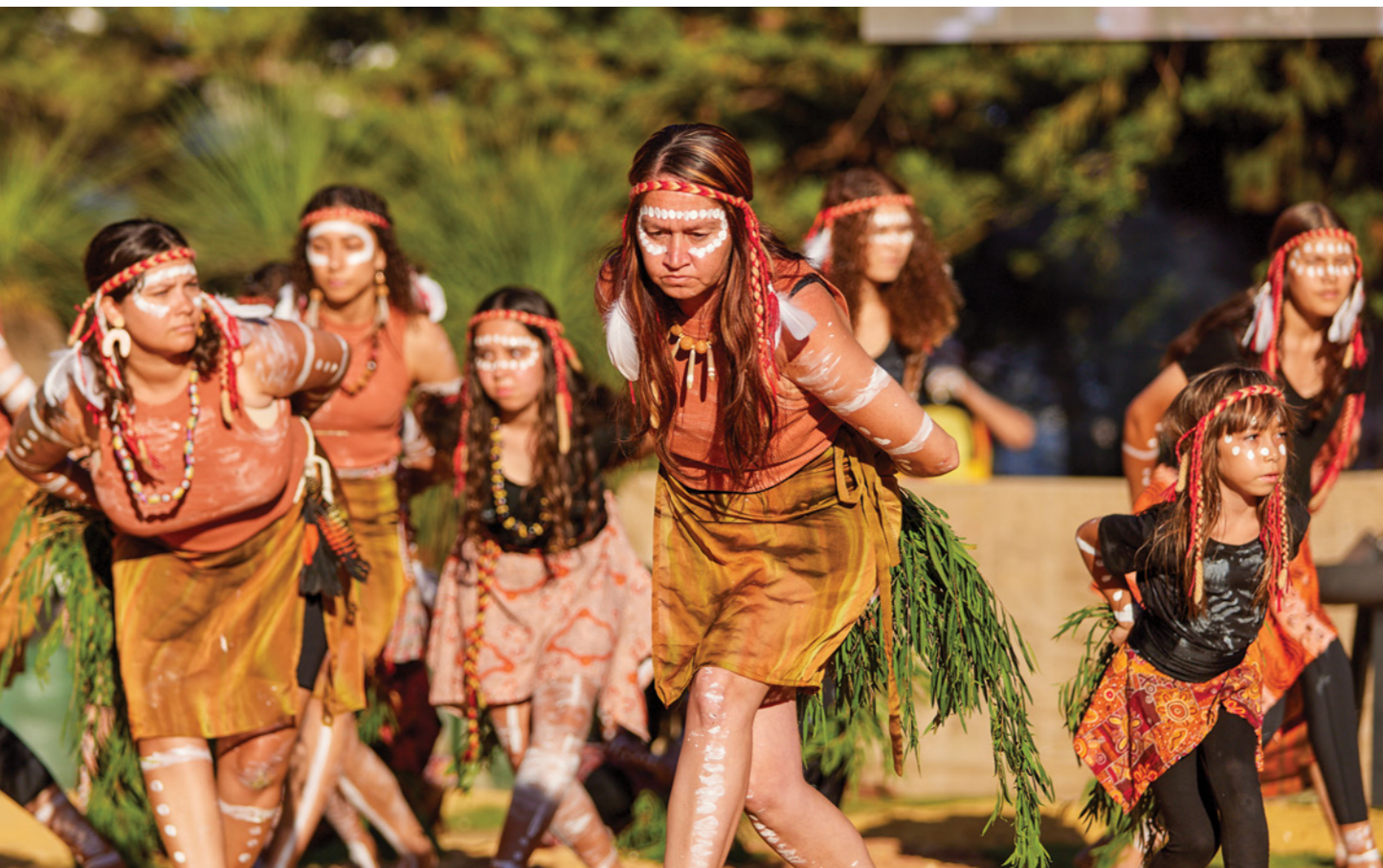
Wardarnji Festival at Esplanade Reserve.