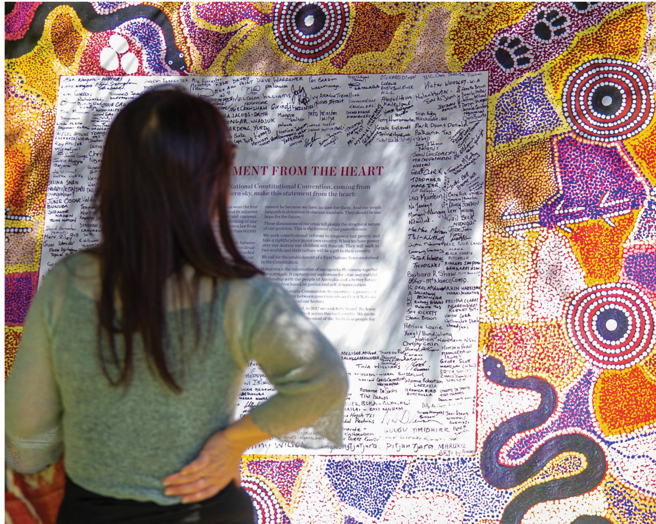
Uluru Statement from the Heart.

Walyalup has social significance to Whadjuk Nyoongar people for the wide scope of its social functions. It was and is a shared space between many Nyoongar people and was a highly significant place of trade and exchange. It was a place where families gathered for kinship and in-law making, cultural and ceremonial business. Walyalup played a significant role in Nyoongar seasonal travel and communication cycles, a place where the bidi's – trails led. It was a place of abundant resources which facilitated hunting, camping and fishing especially in the Nyoongar season of Kambarang .