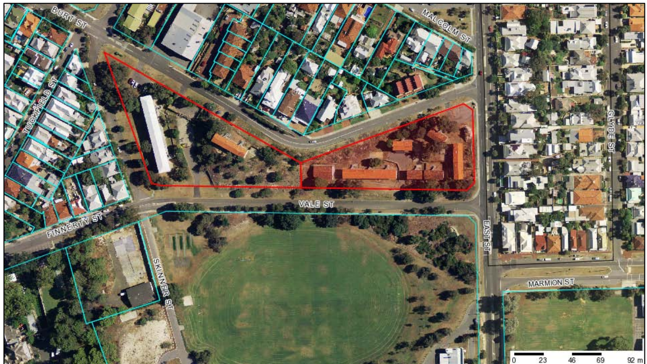
Aerial: 19 – 21 and 23 - 25 Burt Street, Fremantle