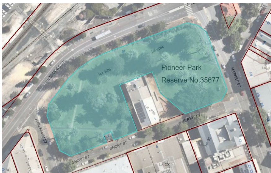
Figure 1 - Pioneer Park Reserve No. 35677

This report recommends that Council accept the new Management Order for Reserve No. 35677 (Pioneer Park) including the finalisation of the attached draft Deed of Agreement and Annexure A for execution by the City of Fremantle.