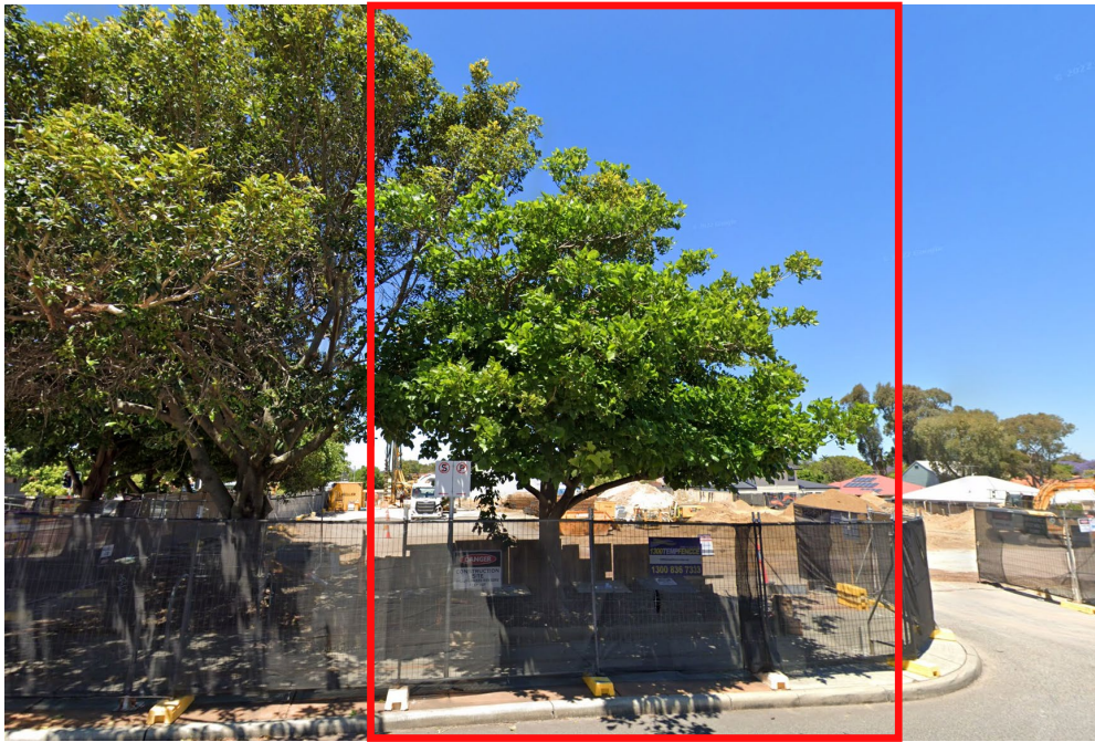
Image: Semi-mature Erythrina indica flame tree the developer has requested the City considers allowing removal.

The developer is also proposing built infrastructure within the road reserve, this was not approved as part of the development application approval. The works proposed are to address access and the difference in level between the buildings floor level and the road reserve and consist of retaining walls and steps. The City would not normally approve development of this nature in the road reserve.