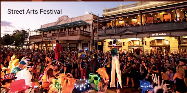
Street Arts Festival

Dine out in Perth's top ranked entertainment precinct. Fremantle is the home of alfresco dining in Western Australia with more than 200 cafés, restaurants, hotels and bars and a vibrant festival and event calendar.