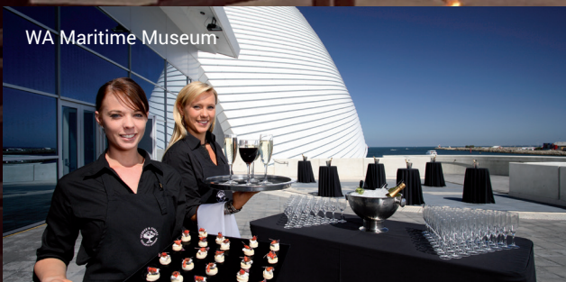
WA Maritime Museum