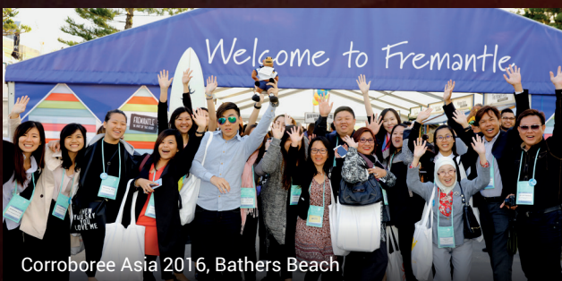
Corroborree Asia 2016, Bathers Beach

Over 700 new or completely refurbished hotel rooms and apartments, many with spectacular views of the Indian Ocean or Swan River.