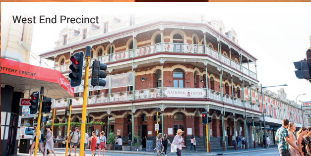
West End Precinct

Book a tour of the award winning Fremantle Prison, it's Western Australia's only built World Heritage attraction.