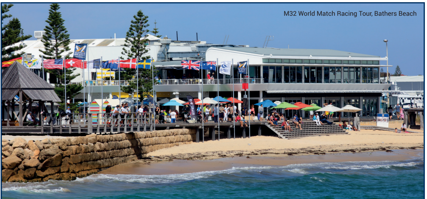
M32 World Match Racing Tour, Bathers Beach