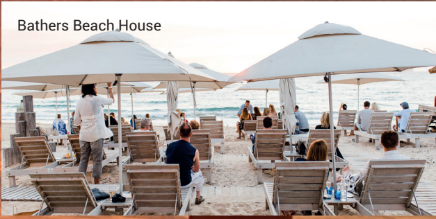
Bathers Beach House

Relax at Bathers Beach House, Australia's first licensed beach area. Watch the sunset over the Indian Ocean or take a stroll along the boardwalk to Fishing Boat Harbour.