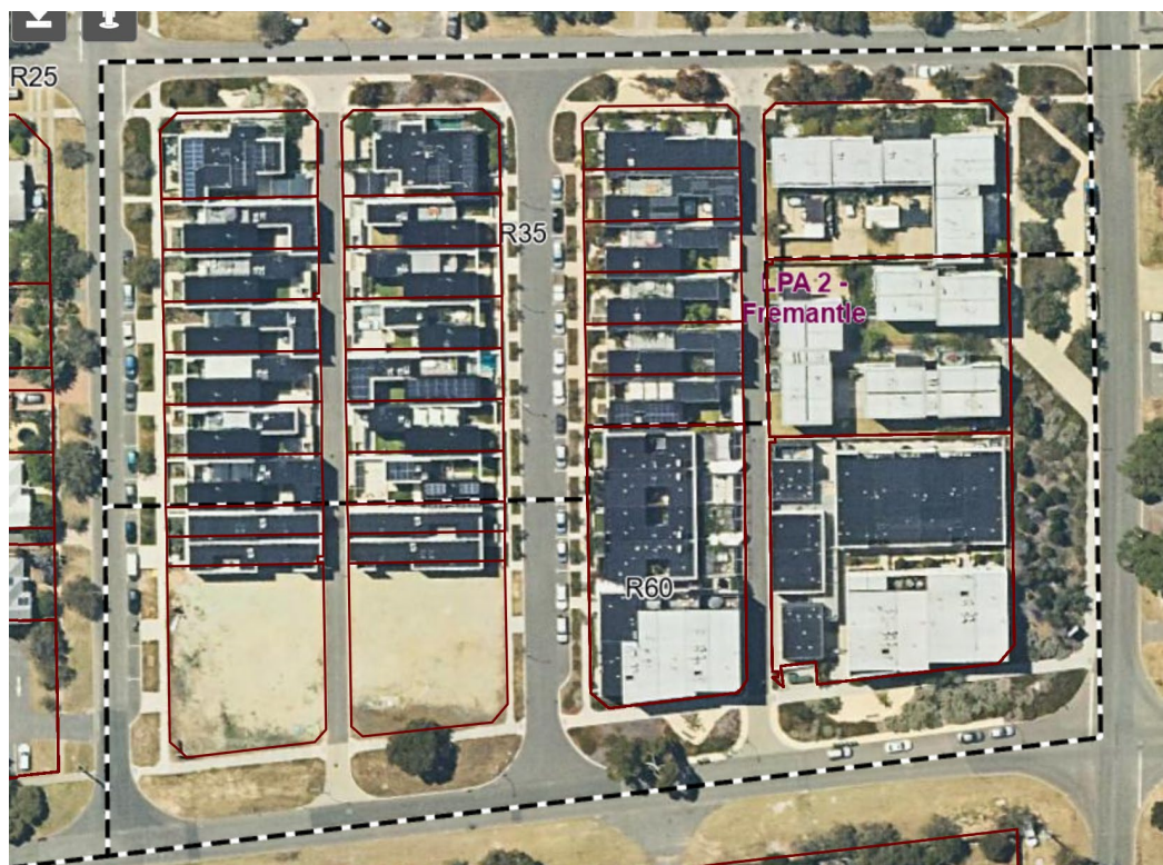
Image 1: Aerial image of the Knutsford Stage 1 and Stage 2 Developments completed by FJM Property and SpaceAgency.

The surrounding development was constructed in two stages, with the dwellings immediately to the north of the subject site approved under individual DA's in 2017. The immediately adjacent lots were constructed from the following previous planning applications: