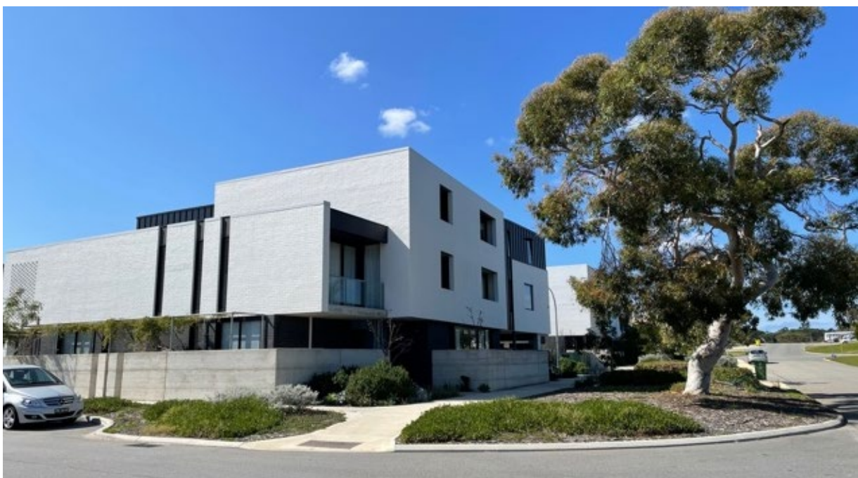
Image 2: Existing development at No.44 Knutsford Street (corner of Rochfort Way and Knutsford Street)