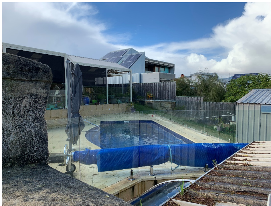
Photo 1: Adjoining south-eastern site at the location of the propose alfresco looking southeast. Limestone dividing fence is in left foreground, adjoining shed roof in right foreground, pool and deck behind.