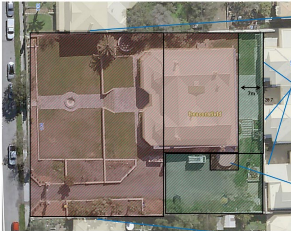
Figure 1: Aerial of the lot, with area permitted for development under the State Heritage Agreement shown in green.