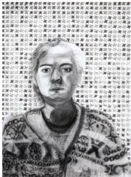
Mary Moore Me with my mind's eye 1980 Charcoal, Ink, pencil 76 x 56.5 No. 100

The same foresight that saved the Asylum from demolition and created a groundbreaking arts centre in Fremantle, allowed the City of Fremantle Art Collection to flourish. For many years the founding Director of the Fremantle Arts Centre, Ian Templeman, nurtured the Collection. His astute purchases from the Arts Centre's exhibitions provide an excellent chronicle of 1970's and 80's Western Australian arts practice and were arguably a critical factor in establishing Fremantle as a haven for artists at that time. Having work purchased by a public collection can be a turning point in an artist's development, providing both financial gain and, more importantly, recognition of their talent.