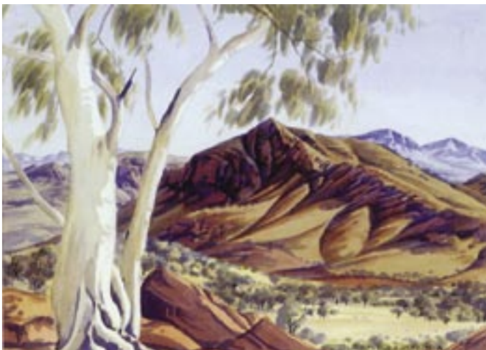
Albert Namatjira Ghost gums in the MacDonnells, NT undated Watercolour 26 x 30.3cms No. 216

This brochure supports the development of new exhibition sites in the City by ensuring the availability of information to the public about the scale and quality of its holdings. The City of Fremantle Art Collection can be seen at the Fremantle Arts Centre, Fremantle Justice Building, Town Hall and City Library.