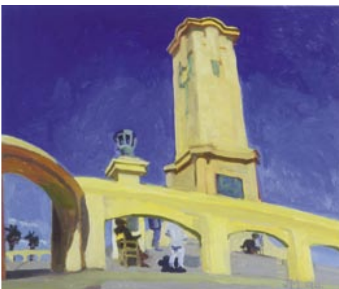
Jane Martin The Monument 1994 Oil on board 50.5 x 60.9cms No. 905