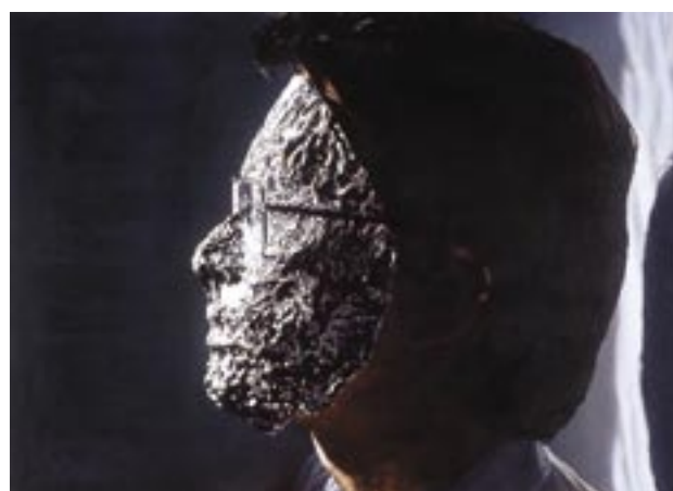
Marcus Beilby Portrait of the artist as a young man 1978 Acrylic paint on canvas 51.5 x 71.5cms No. 7