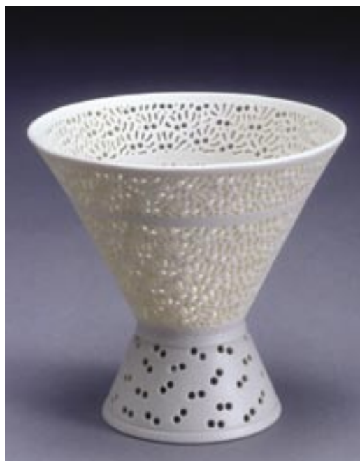
Sandra Black Pierced porcelain bowl 1995 Porcelain 11.5 x 12cms No. 947 © Sandra Black Licensed by VISCOPY, 2005