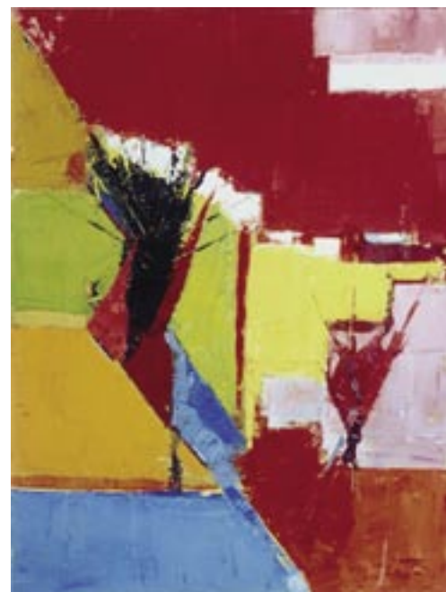
Guy Grey-Smith South of Roebourne 1961 Oil on masonite 101.5 x 75.5 No. 51