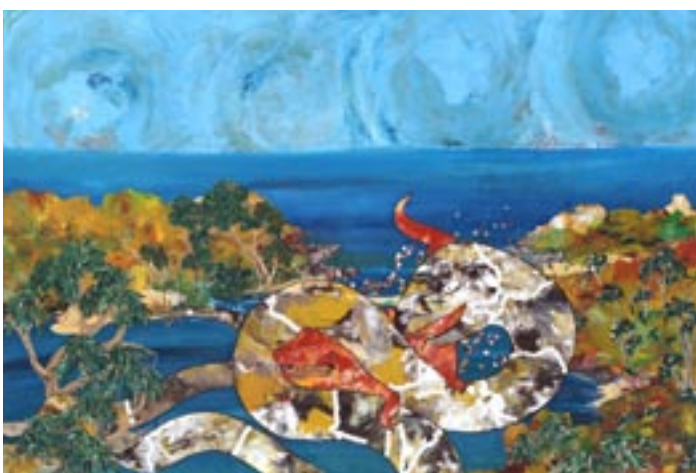
Gloria Bliss Confrontation of the Waterways 2004 Collage and acrylic paint on canvas 61 x 92cms No. 1069