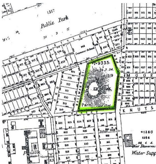
Figure 2 - Map dated around 1880 showing little change to the current boundary lines.

The land was vested as a reserve for the purpose of a public park on 20 July 1904 under the name of “Obelisk Reserve”. The obelisk was replaced by the War Memorial in honour of Fallen Soldiers’ and Sailors’ with an unveiling ceremony on 11 November 1928.